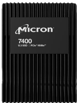
U.3: 7mm and 15mm

It is a flexible line of data center SSDs supporting standard server storage (U.3), cloud and 1U platforms (performance and density focused), and system boot (M.2).